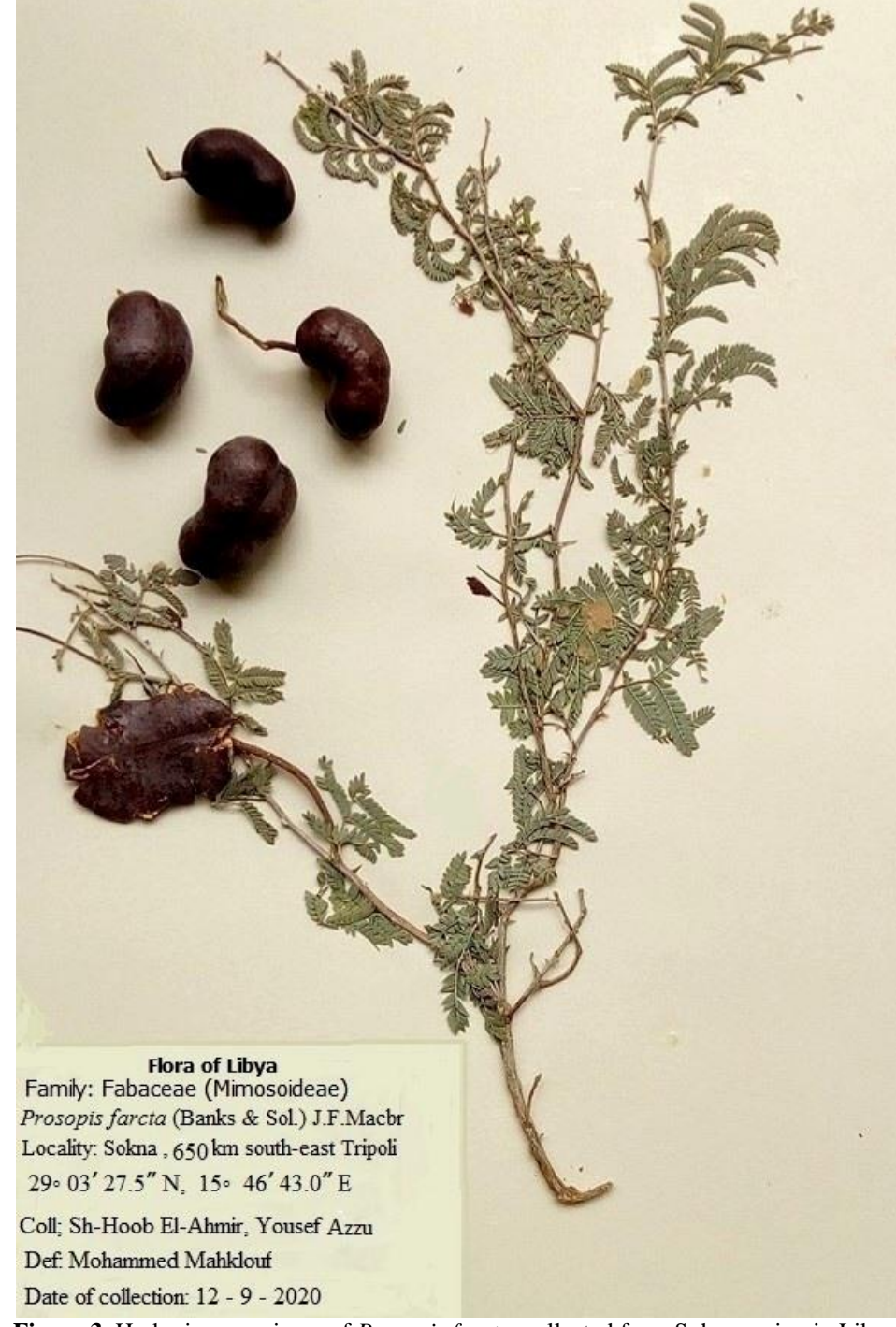
Figure 3. Herbarium specimen of Prosopis farcta. collected from Sokna region in Libya.